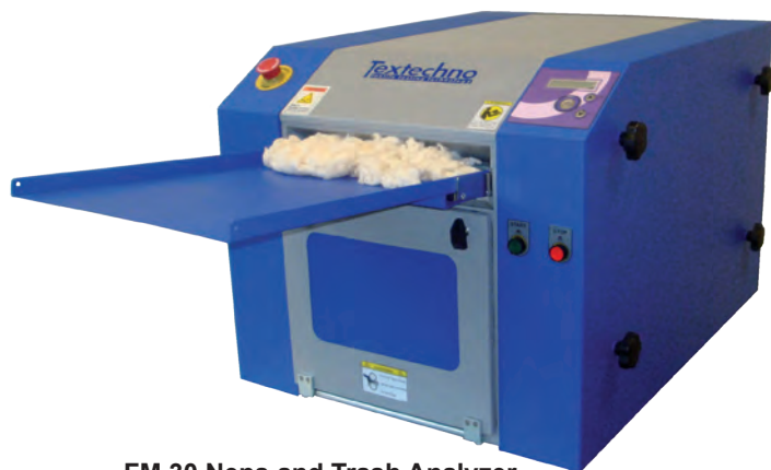
FM 30 Neps and Trash Analyzer

The FM30 is fed with a sample mass of 10 to 50 g, which simply is placed on the front feed plane. The impurities are separated mechanically and pneumatically, by means of a high-speed rotation taker-in and suction unit.